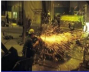
Fabrication & Welding