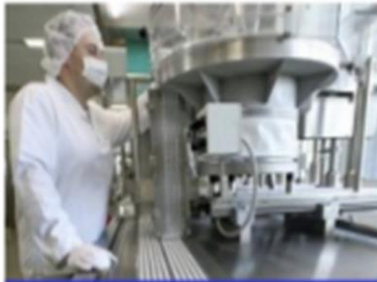
Chemicals & Pharmaceutical