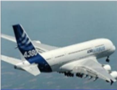
Aerospace & Defence

We have a diverse & wide ranging Customer Base