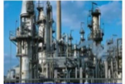
Mining & Oil Industry