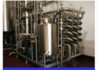
Food & Drink Industry

We have a diverse & wide ranging Customer Base